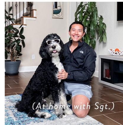
(At home with Sgt.)