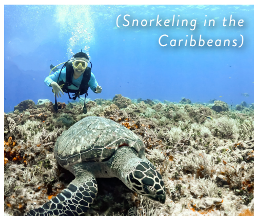
(Snorkeling in the Caribbeans)