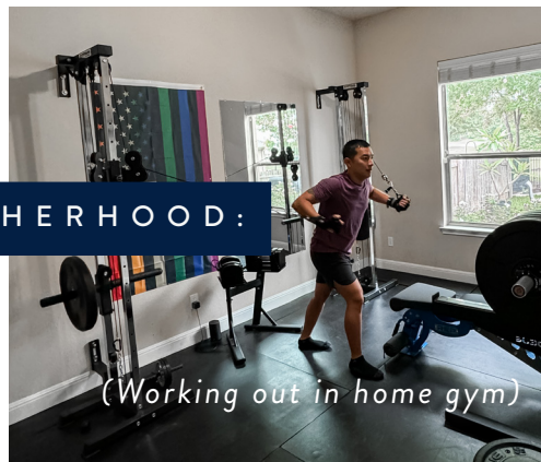
(Working out in home gym)