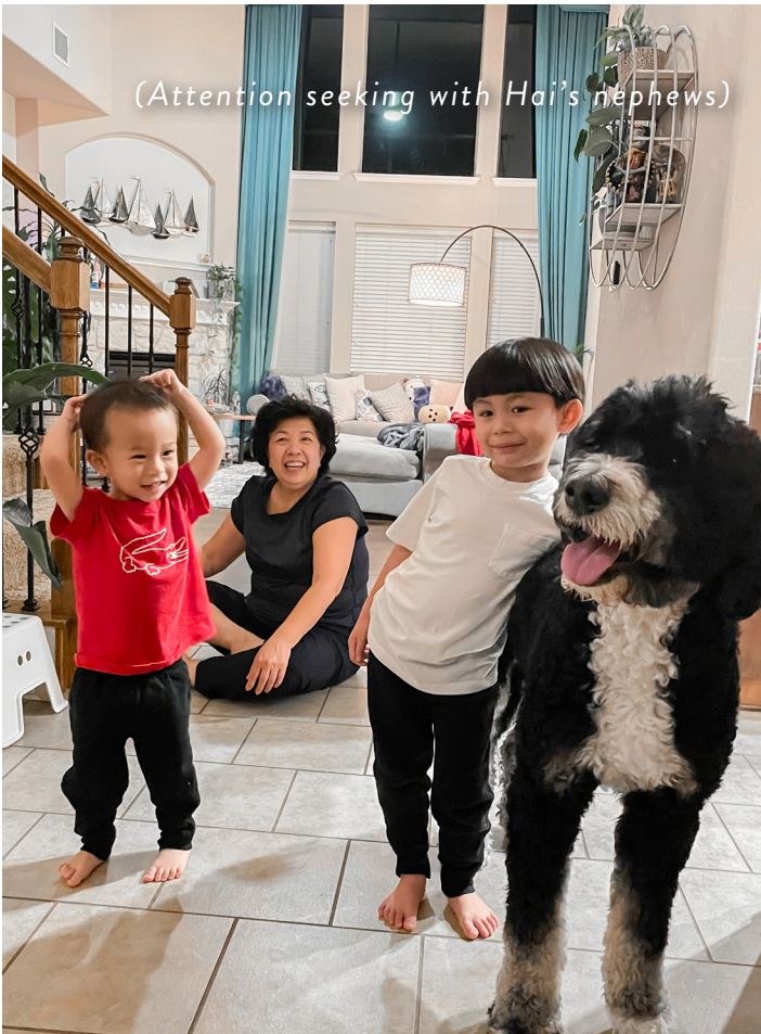
(Attention seeking with Hai's nephews)