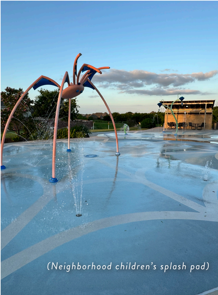
(Neighborhood children's splash pad)