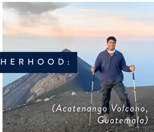
(Acatenango Volcano, Guatemala)