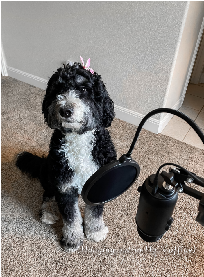
(Hanging out in Hai's office)