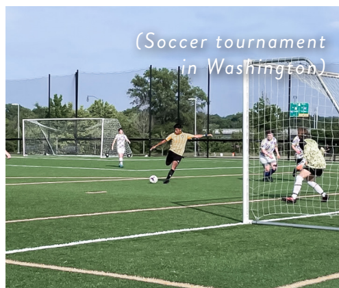
(Soccer tournament in Washington)