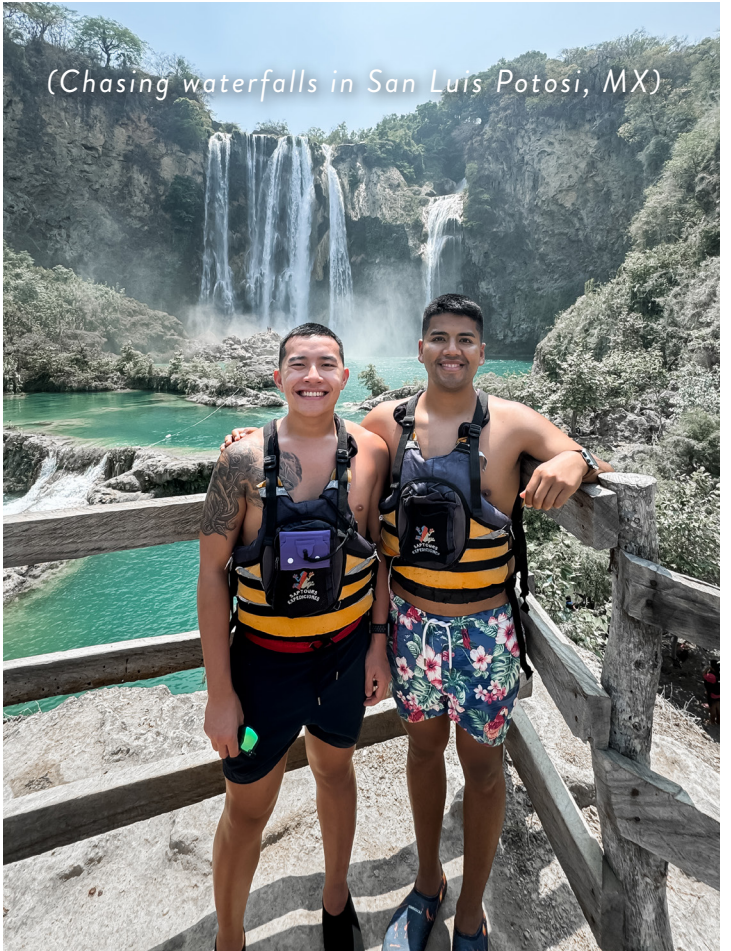
(Chasing waterfalls in San Luis Potosi, MX)