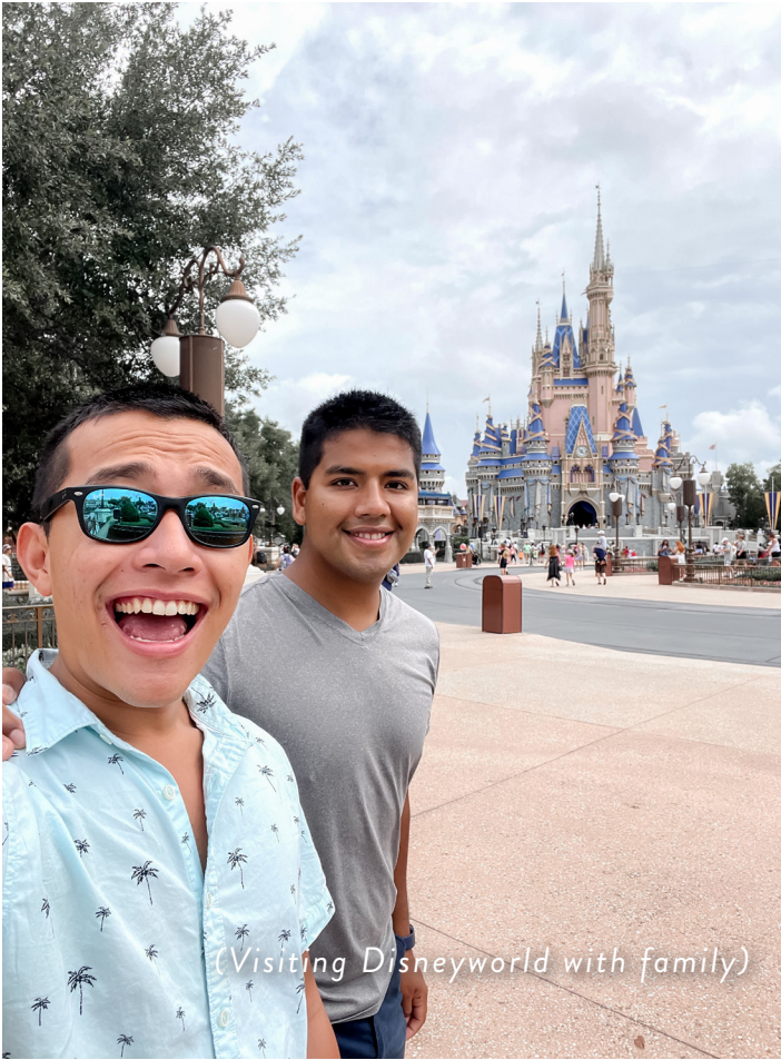
(Visiting Disneyworld with family)