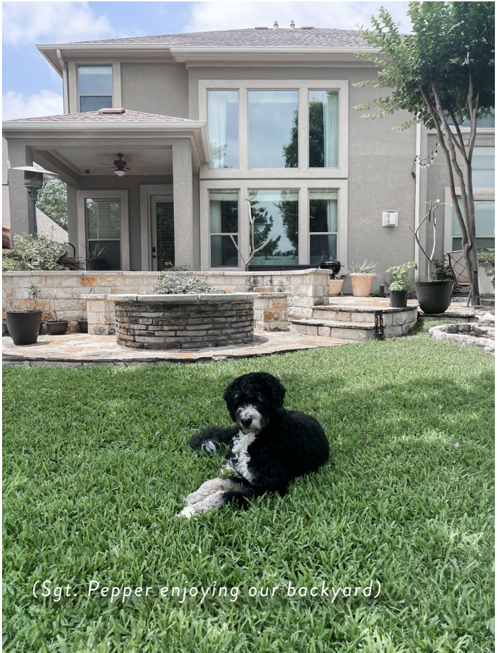
(Sgt. Pepper enjoying our backyard)