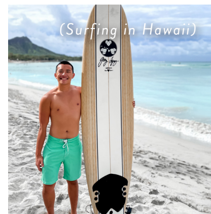
(Surfing in Hawaii)