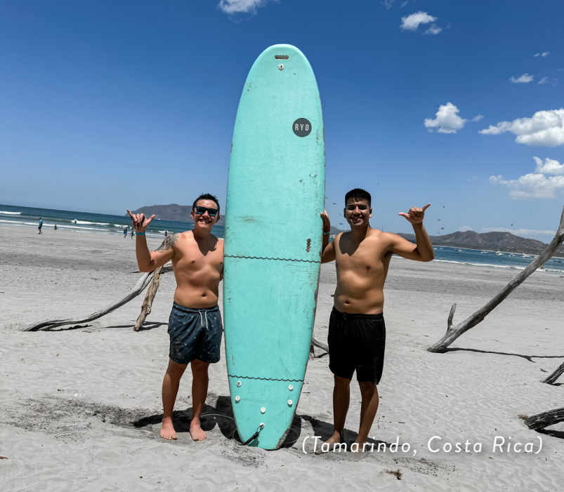
(Tamarindo, Costa Rica)