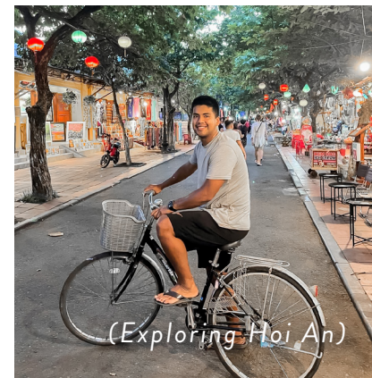
(Exploring Hoi An)