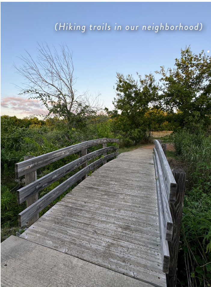
(Hiking trails in our neighborhood)