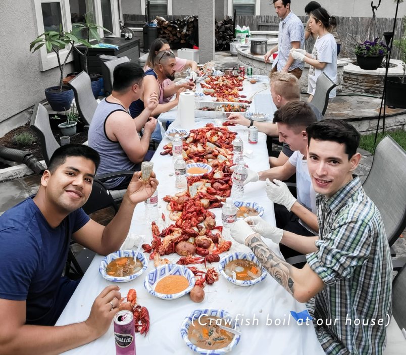
(Crawfish boil at our house)