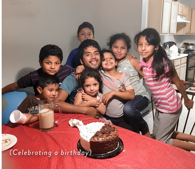
(Celebrating a birthday)