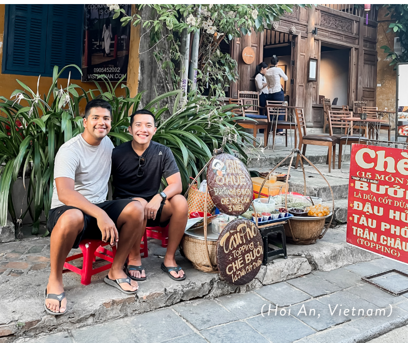
(Hoi An, Vietnam)