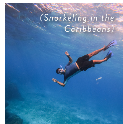
(Snorkeling in the Caribbeans)