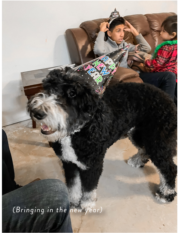
(Bringing in the new year)