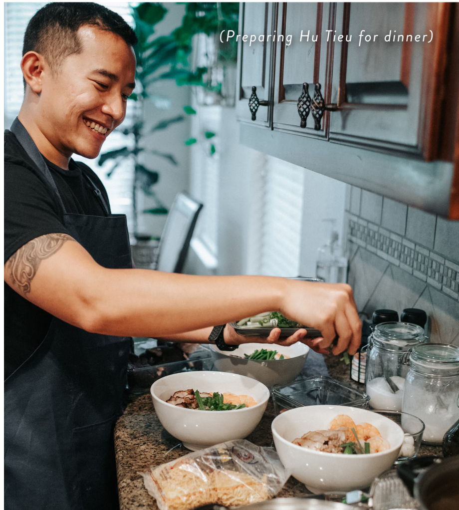
(Preparing Hu Tieu for dinner)