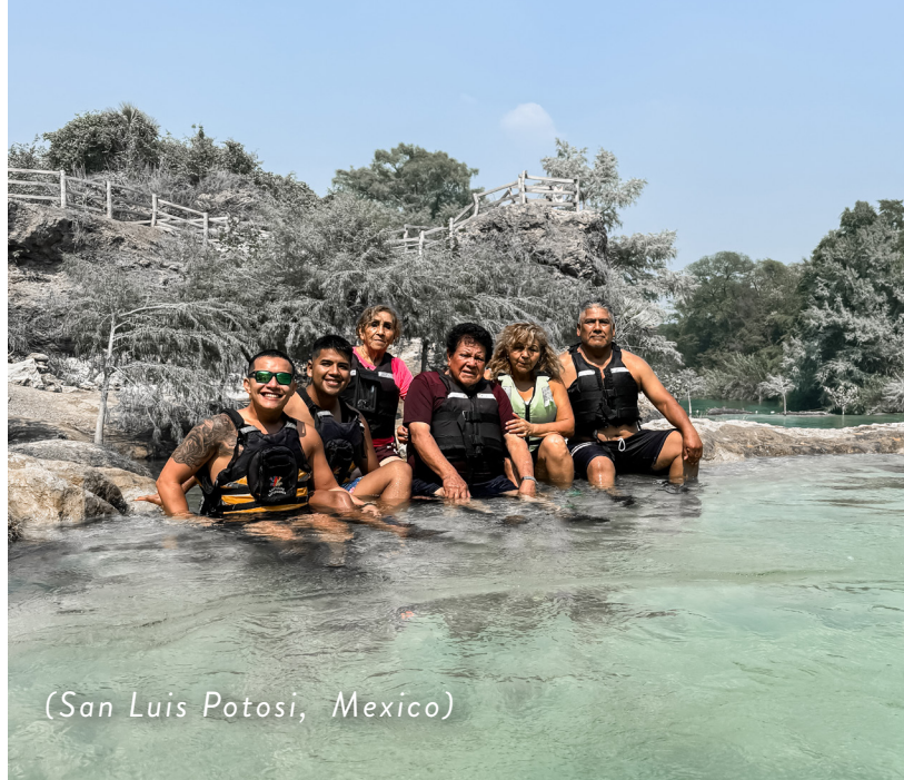
(San Luis Potosi, Mexico)