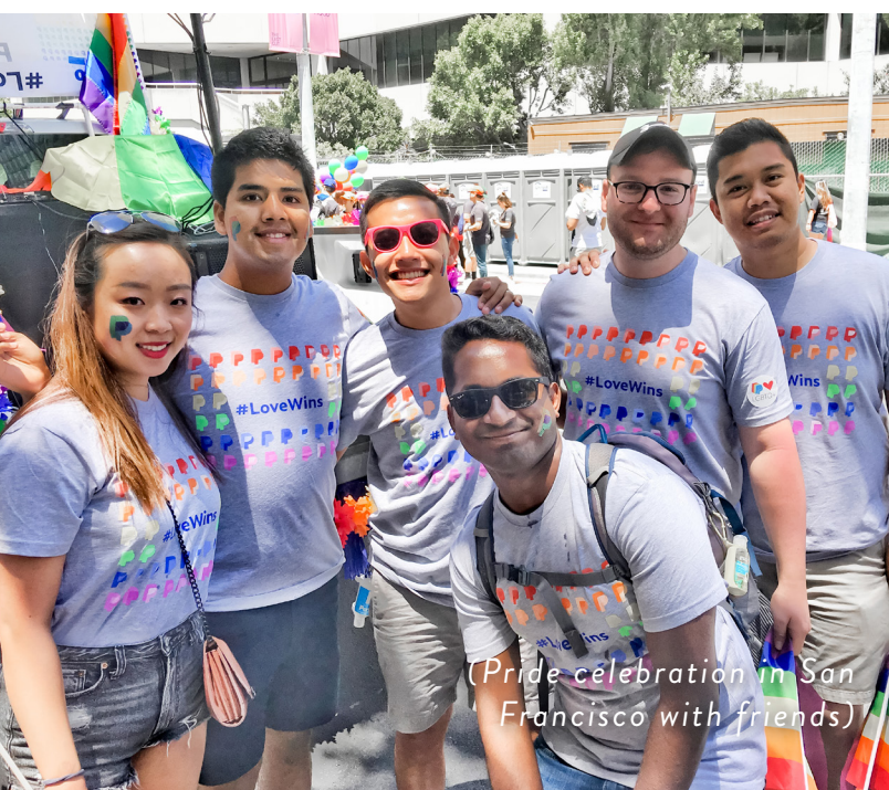
(Pride celebration in San Francisco with friends)