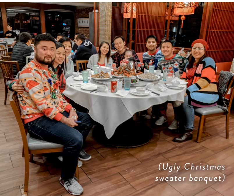
(Ugly Christmas sweater banquet)