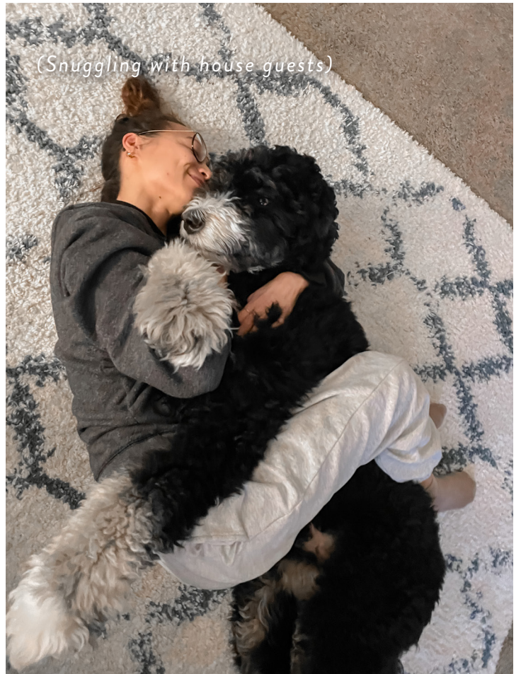
(Snuggling with house guests)