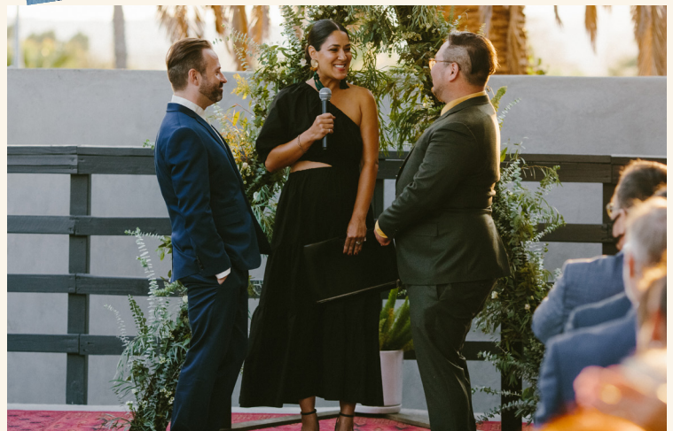
Our "big day!"