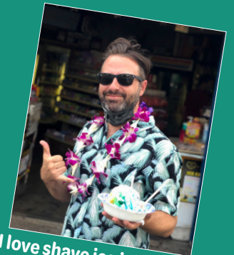
I love shave ice in Hawaii!

Saturday Activity Brunch & Farmers Market