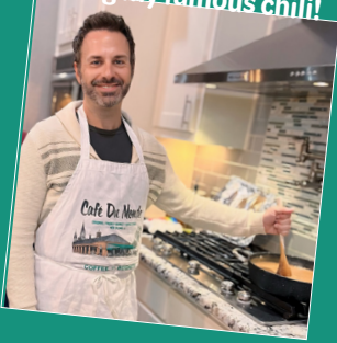
Cooking my famous chili!