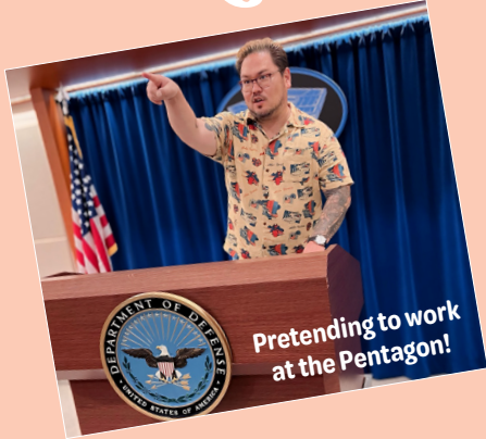
Pretending to work at the Pentagon!