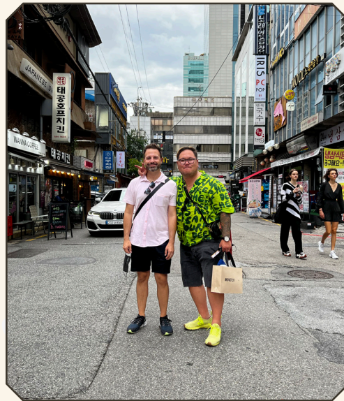
Seoul, South Korea