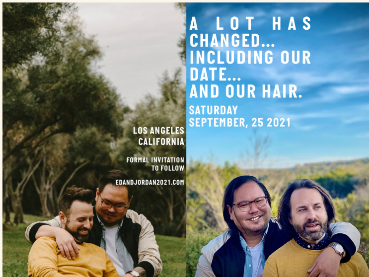
Our wedding Save The Date!