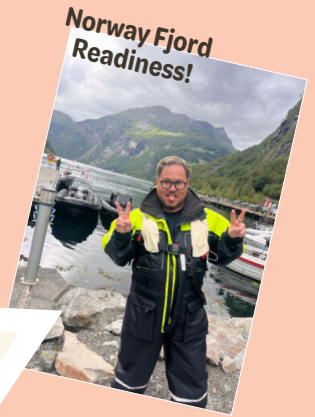
Norway Fjord Readiness!