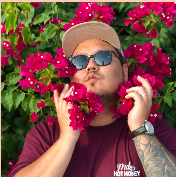
Glamming it up!

In him, I've found not just a partner, but a confidant, a best friend, and my biggest cheerleader. His boundless love fills me with gratitude. As we look to the adventures ahead, I can't wait to see him surround our child with the same love, compassion, and support that he always provides for me. I just know he'll be the most fun dad – bringing smiles and joy and laughter to every minute of every day.