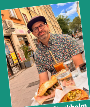
Snackin' in Stockholm

Ice Cream Flavor Jeni's Goopy Butter Cake