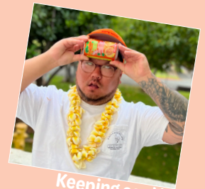
Keeping cool in Hawaii!