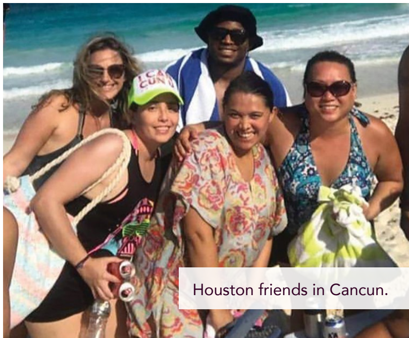
Houston friends in Cancun.