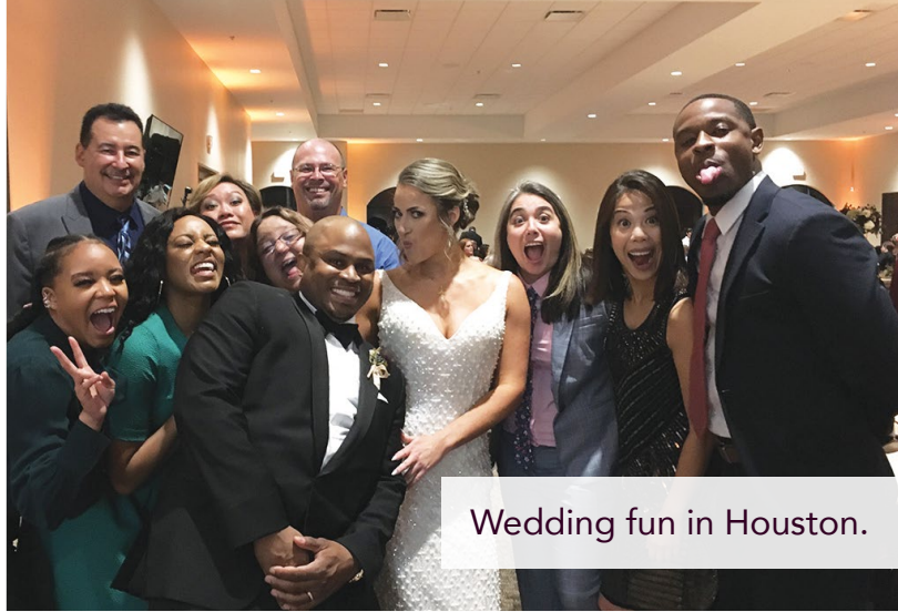
Wedding fun in Houston.

Our chosen family is thrilled about us becoming parents, and they are all excited to be like aunties and uncles to our child.