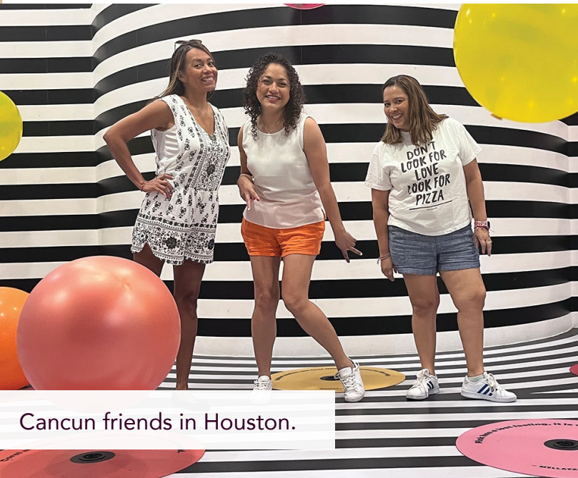
Cancun friends in Houston.