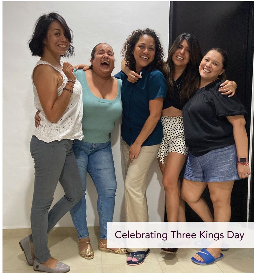
Celebrating Three Kings Day

Our chosen family is thrilled about us becoming parents, and they are all excited to be like aunties and uncles to our child.