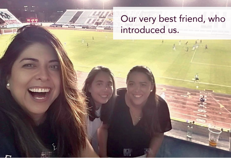
Our very best friend, who introduced us.