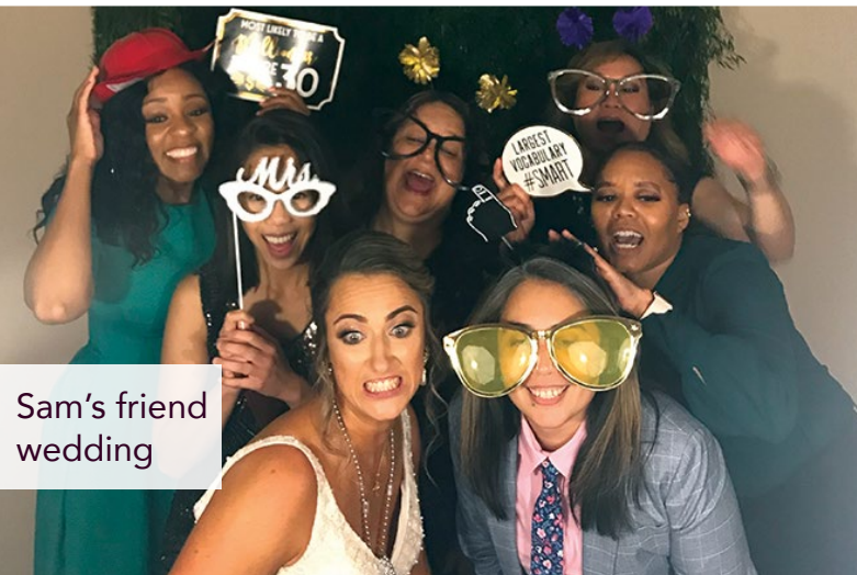
Sam's friend wedding