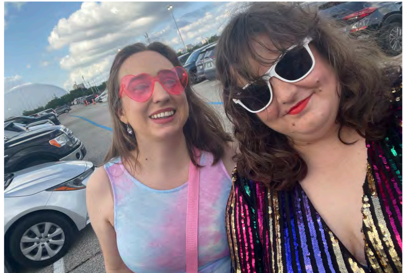
We dressed up for Taylor Swift's Eras tour!

forming relationships with students. I really value the time I spend with them, although the best part about my career is having long breaks to focus on being with my family!