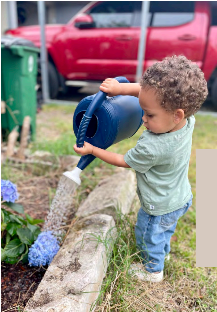
He loves to be a helper! Here he is watering flowers.