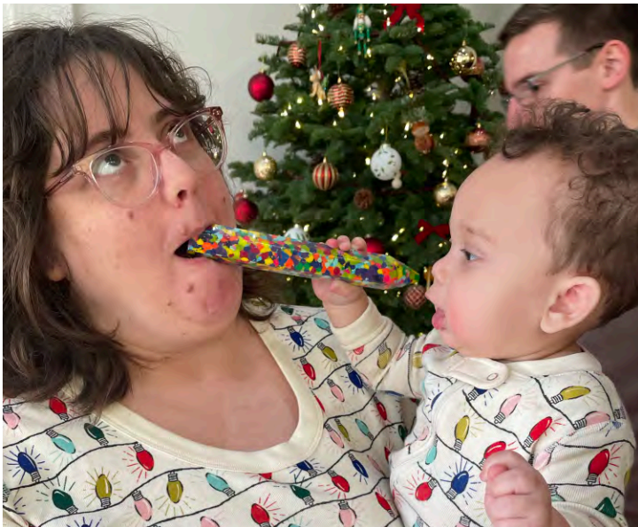
I love being silly with my sweet kiddo.