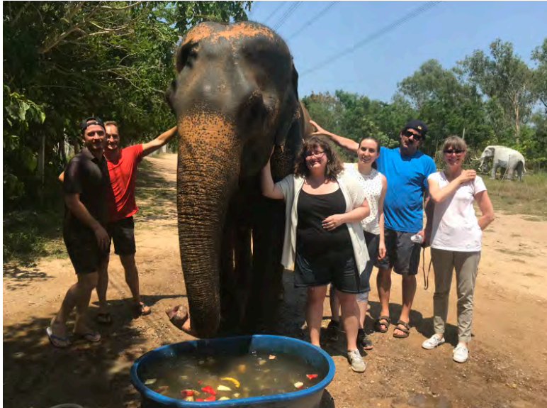
In Thailand with our friends and Amanda's dad and stepmom.