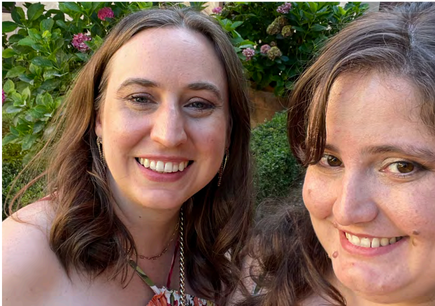
Family wedding in Tuscany.

Family means the world to me. I love watching my son learn and grow – seeing him develop from a squishy newborn to a rambunctious toddler with a hilarious sense of humor has been the most incredible experience of my life. I've learned so much along the way and I'm looking forward to welcoming a second child into our lives as a more seasoned parent – although I know they will have so much to teach me as well!