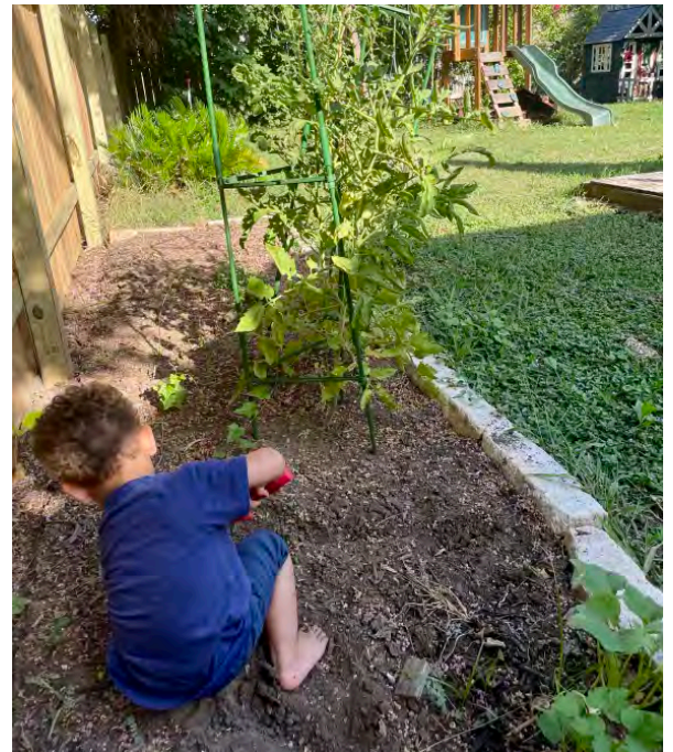
Room for gardening AND lots of play.