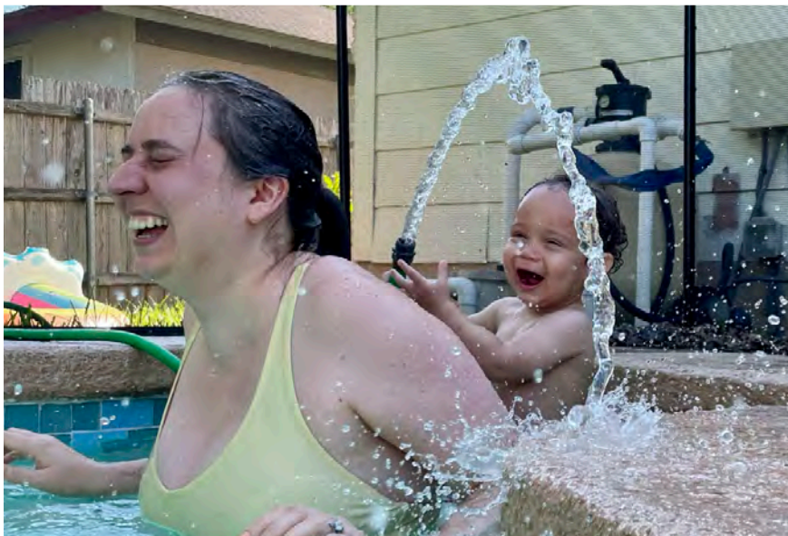
Play time in the pool.