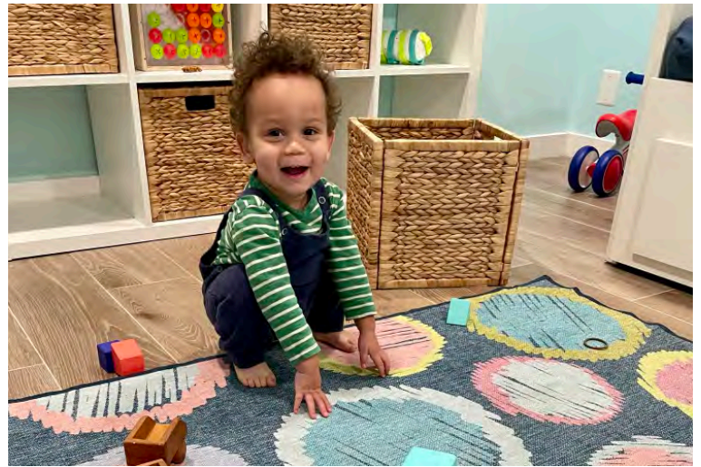
Our playroom is so fun and colorful; we love it in there.