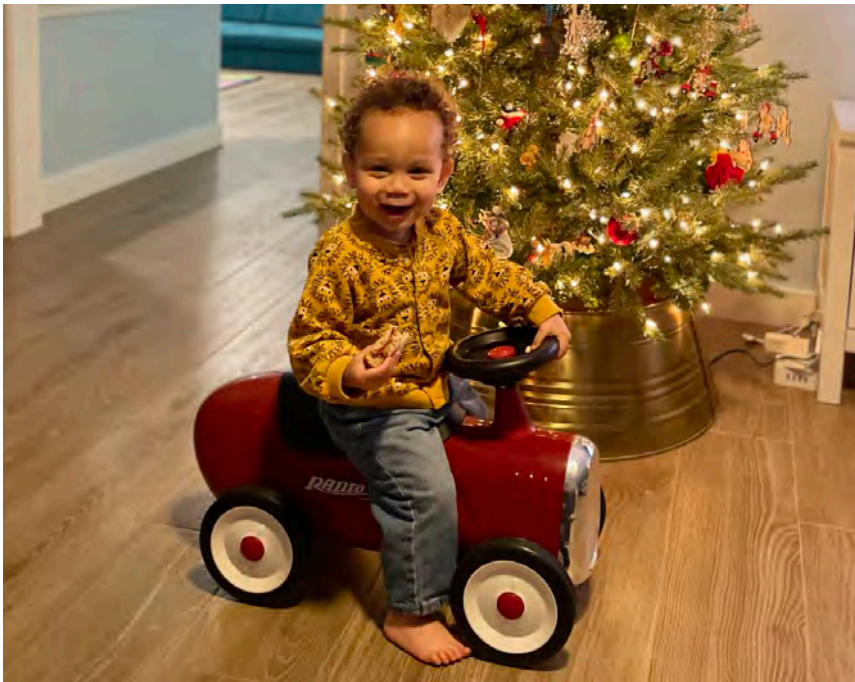
Christmas in our living room!