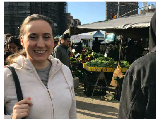
Trip to the farmer's market.

Some of my hobbies include: reading, gardening, travel, home improvement projects, walking