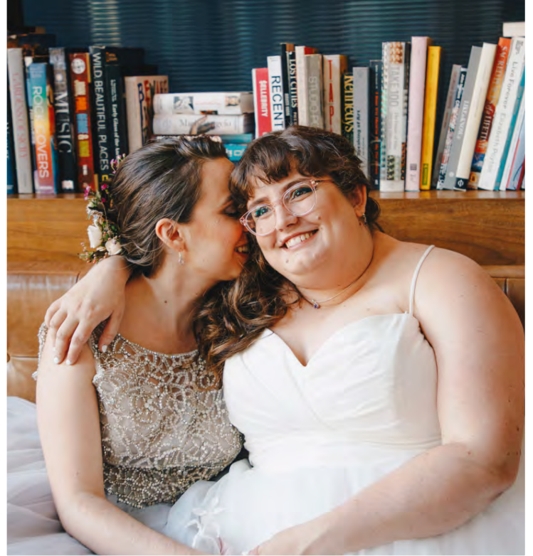
Our wedding was one of the best days of our lives!

– we bonded over shared interests and values, including a love of literature and a passion for life-long learning. We married in 2019, in, fittingly, a used bookstore.