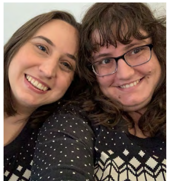
We do matching Christmas pajamas as a family every year!