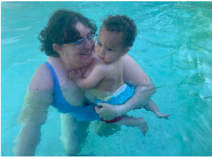
We love swimming in our pool together!