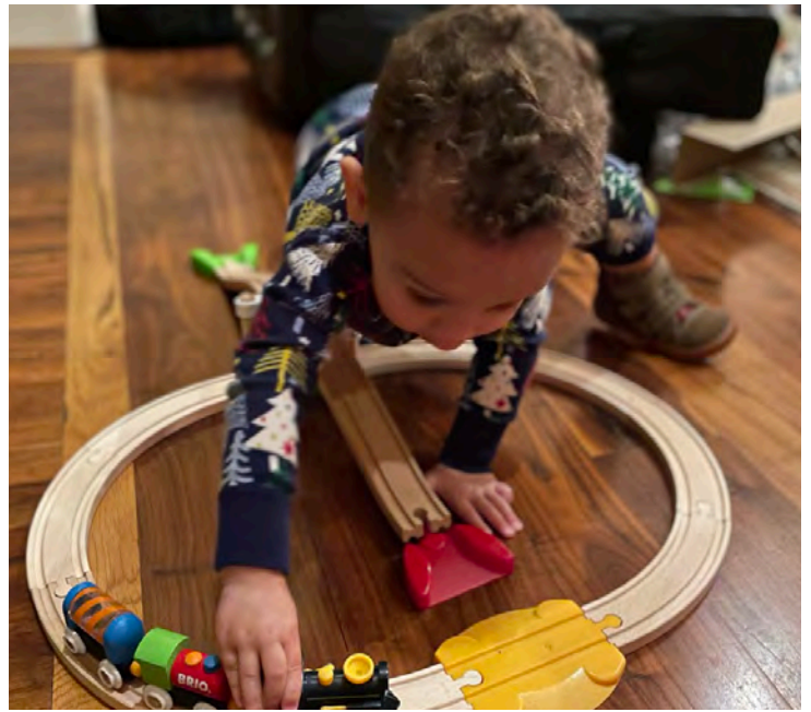
He is a huge fan of trains!