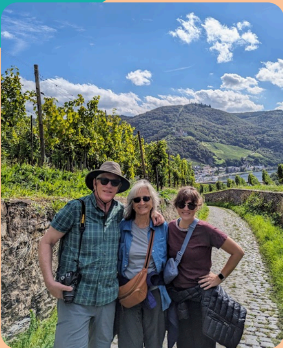
German wine country!