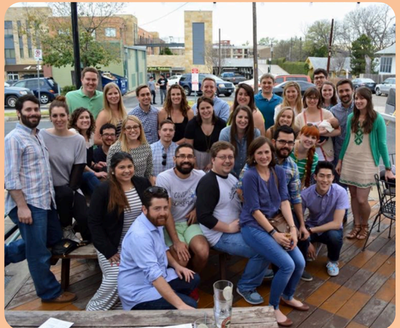
Celebrating our engagement with friends