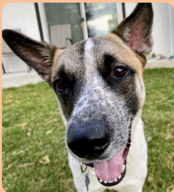
Our sweet pup Oatmeal