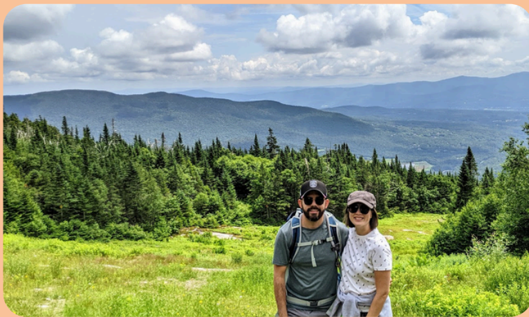
Hiking in Vermont