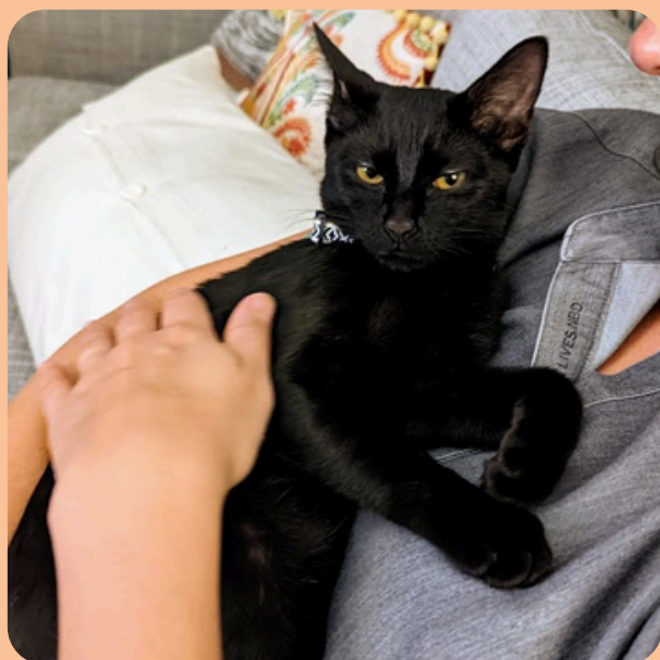
Binxy , the newest addition