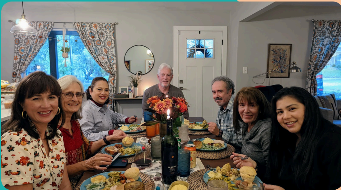
Our families together at Thanksgiving