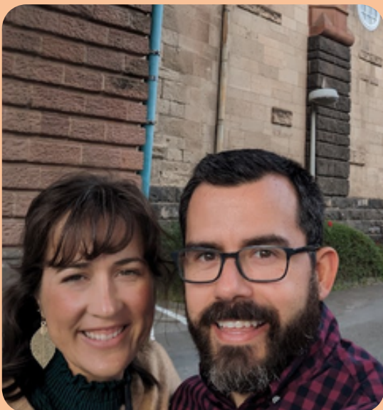
On a family trip to Germany