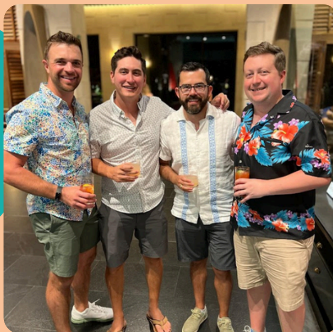
On a friend trip in Mexico