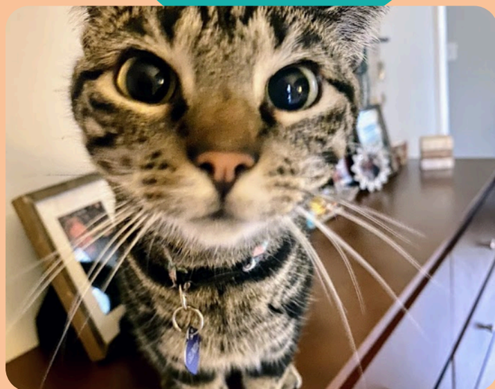
Glinda , the Queen of the house