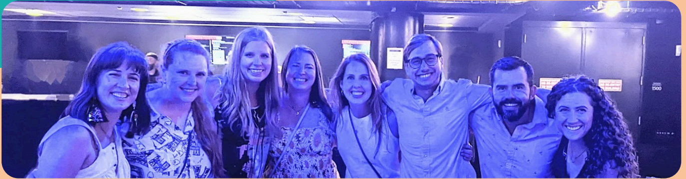
Seeing The Head & the Heart with our Austin friends

When not in holiday mode, we spend our free time seeing live music, going on hikes/walks, and volunteering with TreeFolks (a local tree planting organization). We are both super-volunteers, which means we get to lead events and spread positivity around all the benefits trees provide to a society!