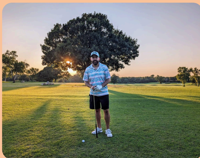
Shortly before I whiffed a shot

SOME OF THE TREATS I'VE MADE OVER THE YEARS!