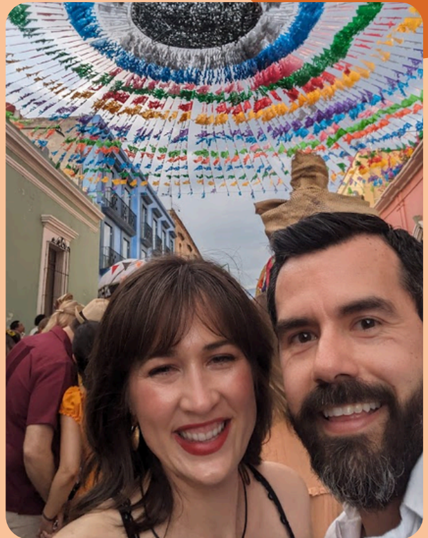
During a calenda in Oaxaca