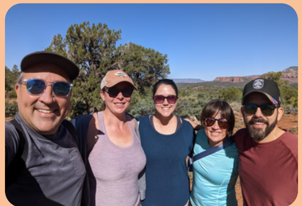
Vet friend reunion in Sedona