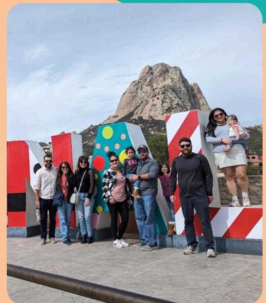
Family trip to Peña de Bernal